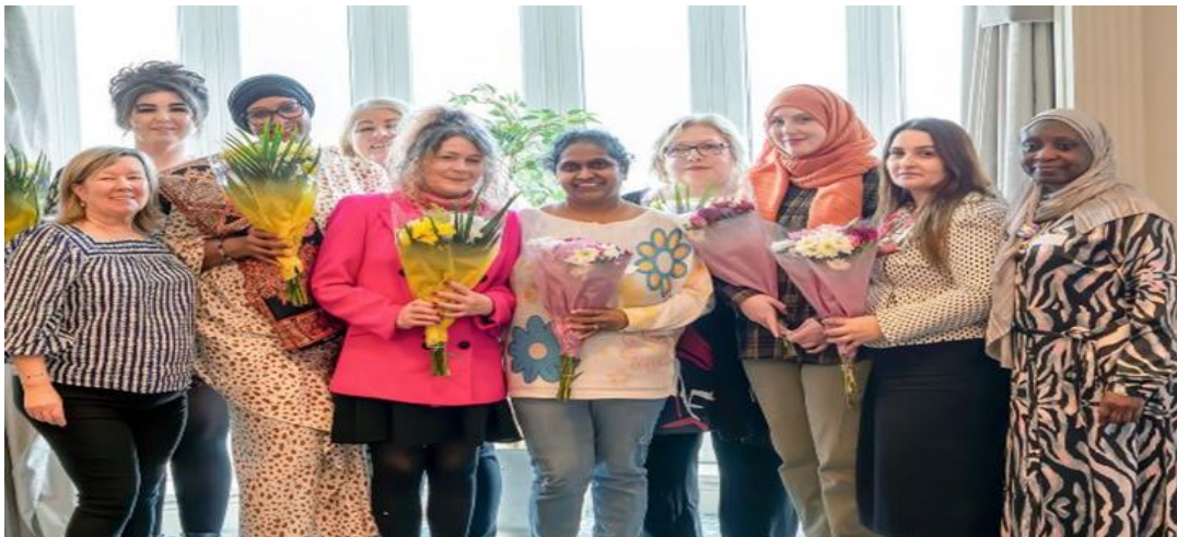
Traveller women integrating with other SICAP groups for International Women’s Day event