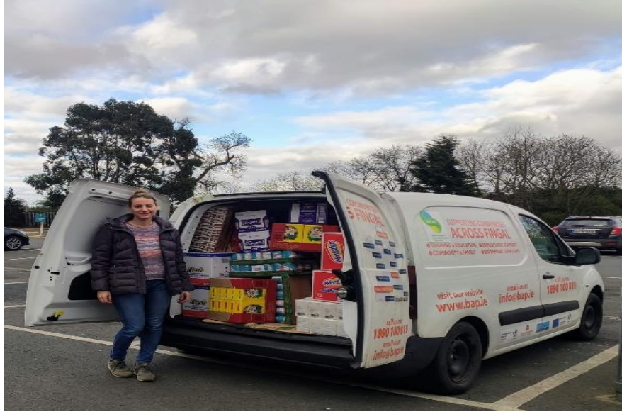
COVID-19 resource pack deliveries

In more recent years, Empower has hosted non-caseload events including a Voter Registration Day attended by 20 members of the Balbriggan Travellers Project ahead of the referendums on Family and Care. Those newly registered Travellers were supported to cast a vote in local and European elections while ensuring impartiality and thereby exercise their democratic mandate. ix In conjunction with the Balbriggan Travellers Project, we also held a joint event at Matt Lane as part of Fingal Social Inclusion Week in November 2024, to tackle health inequalities experienced by Traveller women. Our Healthy Food Made Easy Coordinator delivered a sample session and we held a workshop focusing on the menopause. x Period dignity packs were made available to those who attended, and 33 of the women who attend availed of a free health check and blood pressure check. xi