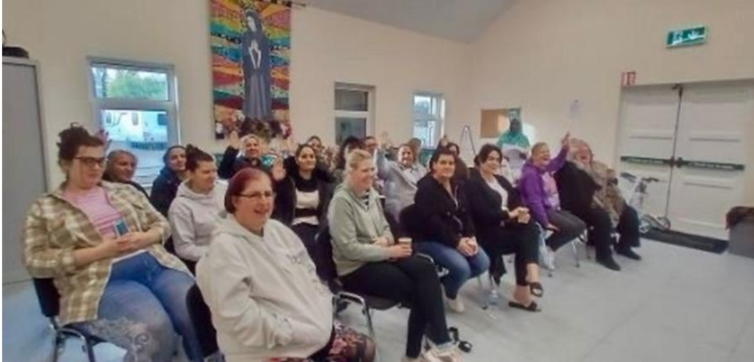
Traveller Women attending voter education workshop

The SICAP Horizontal Themes of Equality, Community Development and Collaboration are central to Empower's values, and are reflected in our strategic reviews, programme planning and day-to-day delivery. Since our foundation, community development principles of consultation, participation, empowerment, social justice and equality have been evident in engaging with the Traveller Community through facilitating focus groups to identify their needs prior to SICAP tendering processes and through a variety of outreach practices. Empower has supported several Traveller organisations at each stage of the community development matrix in Fingal. Community Development is a developmental activity composed of both task and process. The task is the achievement of social change linked to equality and social justice, and the process is the application of the principles of participation, empowerment and collective decision making in a structured and co-ordinated way. iii