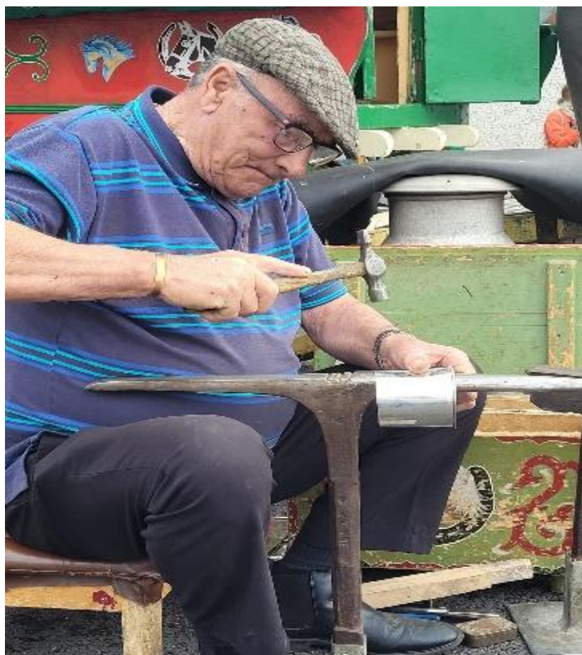
Tin Smith workshop 2025

Empower’s approach demonstrates that sustained, collaborative, and culturally responsive engagement is key to achieving meaningful inclusion and equity for the Traveller Community.