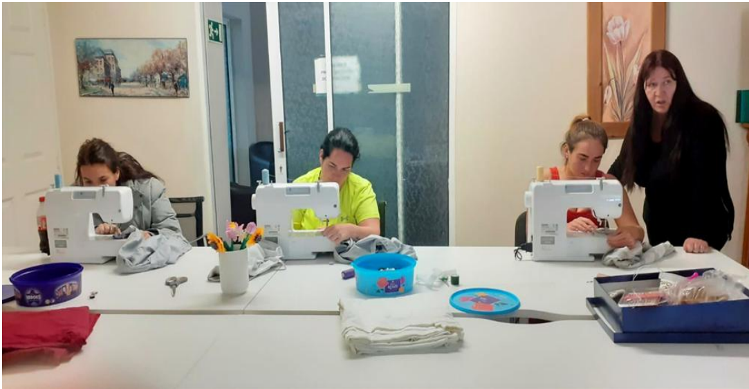
Traveller Sewing Group Blanchardstown

social isolation among Traveller women by forming a sewing group with the objective of possibly developing a social enterprise under Goal 1. We have also formed a Traveller-specific Parent and Toddler Group in Mulhuddart. This allows Traveller women who are limited to engagement in education and training due to lack of affordable childcare to participate in a social activity by bringing their children with them.